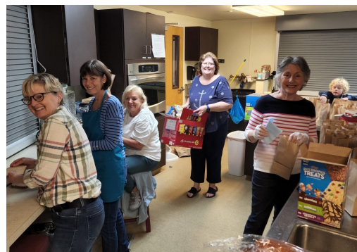
Sandwich making crew, 6.29.22

For the June outreach project we provided 200 sack lunches to the Tacoma Rescue Mission. Many gathered to make 400 sandwiches and assemble the sack lunches. Thank you to all of the workers and all those who donated supplies for the lunches. Left over supplies were donated to the mission for further lunches. Along with congregational support and a grant from Thrivent this project was a great success.