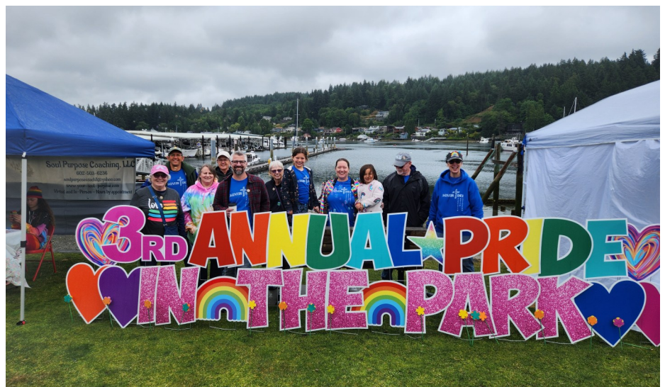
Agnus Dei had a booth at the Pride in the Park Event in June