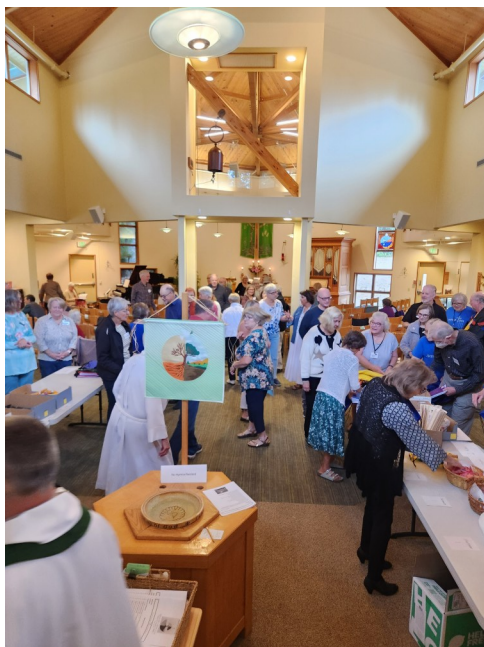
Assembling School Kits on God’s Work Our Hands Sunday