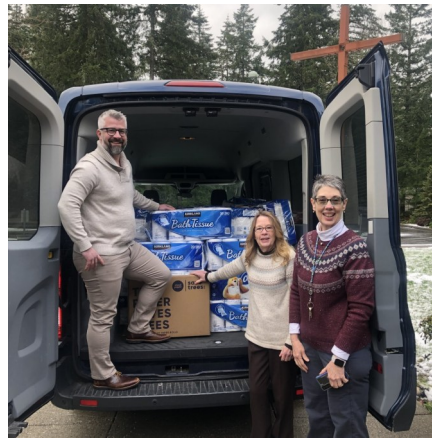
Toilet Paper delivered to FISH Foodbank