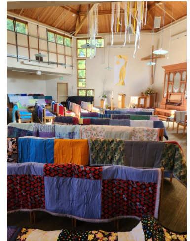
Quilt and Kit Blessing for LWR