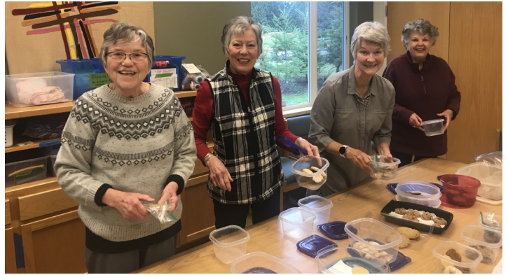
Christmas Cookies for Shut-Ins

The Team continues to serve the congregation in many ways. This team is very active in caring for congregation and the personal needs of members and families. The team organizes transportation for individuals to church and doctor's appointments. When families are in need of meals the team organizes a meal train. Cards are sent to church members for birthdays, get well, and sympathy, etc. Visitation to shut ins are also provided by the team. At Christmas the team delivered cookies to shuts in our congregation and community. The pictures of the team assembling cookie boxes are at right.