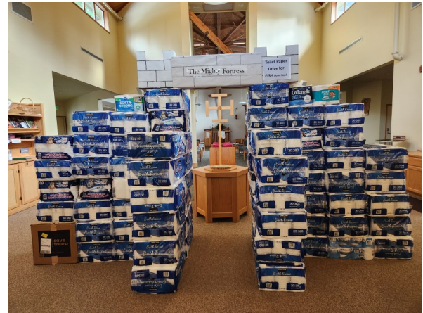
Toilet Paper Drive– January